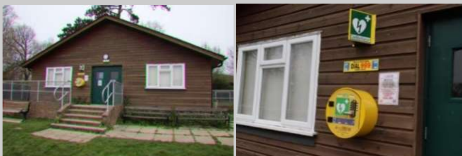
Figure 1 – John Pears AED