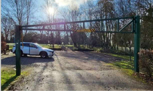
Figure 2 – John Pears car park entrance

Note: Maximum vehicle headroom is 2.1m, 6' 10"